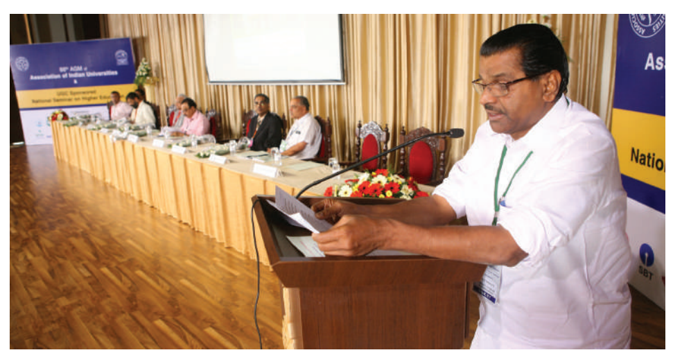
Sri. Thiruvanchoor Radhakrishnan, Hon'ble Minister for Revenue and Vigilance addressing the delegates after lighting the lamp.

integration tools like environment education, consumer awareness, consumer rights etc. The minister concluded with a positive note on the efforts taken by the Cusat Vice chancellor and his team in organising the 86<sup>th</sup> AGM of AIU and the UGC-sponsored national seminar in a befitting manner.