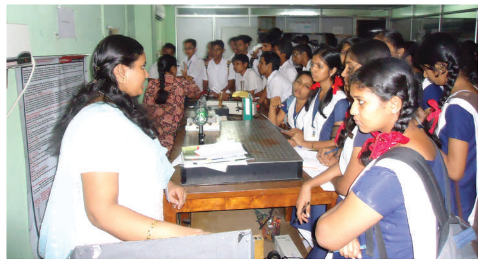
An interactive session during the optics fair.