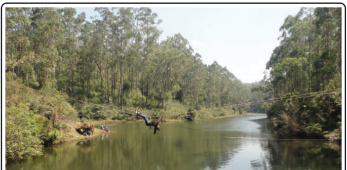
Cusat Students under the leadership Association of the Dept. of Physical Education are participating an Adventure Training Camp Conducted at National Adventure Academy, Munnar.